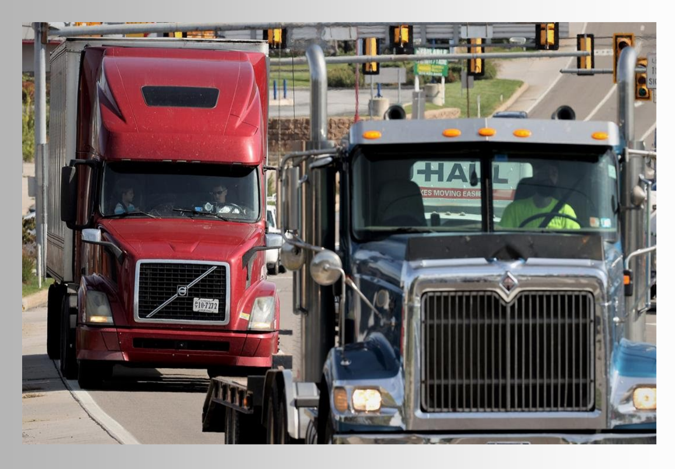
The trucking boom appears to be tapping the brakes.

The strong freight demand that has delivered bumper earnings for truckers looks to be waning, the WSJ Logistics Report's Lydia O'Neal writes, as shipping demand falls more closely in line with the supply of trucks. That's a steep change from the past year and a half, when the rush by retailers to restock depleted inventories sent shippers scrambling for capacity in a tight freight market. Now, spot rates are tumbling and several indicators suggest freight volumes are slimming. Inflation may be taking a toll on underlying demand, but ongoing supply-chain bottlenecks also could be winnowing shipment counts.