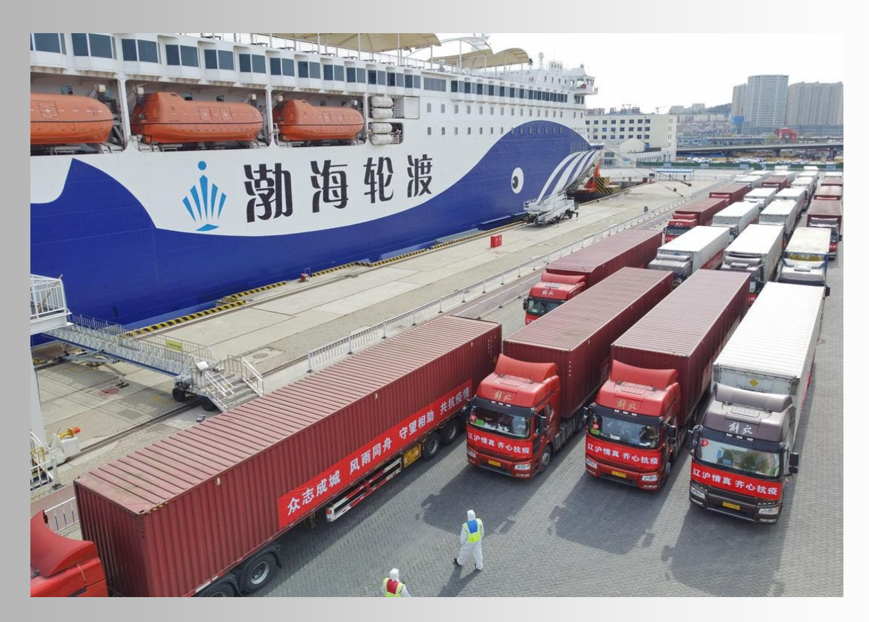
Covid-19 lockdowns are casting a longer shadow over China's economy.

Localized lockdowns are proliferating across the country, the WSJ's Joyu Wang and Liyan Qi report, as China wrestles with growing numbers of cases and a deepening impact on regional and international supply chains.